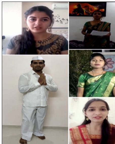
Monologue Student participation Final Matrubhasha Diwas - Screen shot