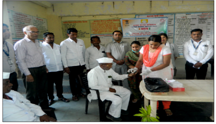
Hemoglobin Chekup Drive - Unnat Bharat Abhiyan

The villagers who took part in the drive were given sanitizer bottles and biscuits. About 70 men and women got their hemoglobin levels checked. They also received advice on the proper solid food consumption and beverages to maintain a balanced diet and healthy lifestyle.