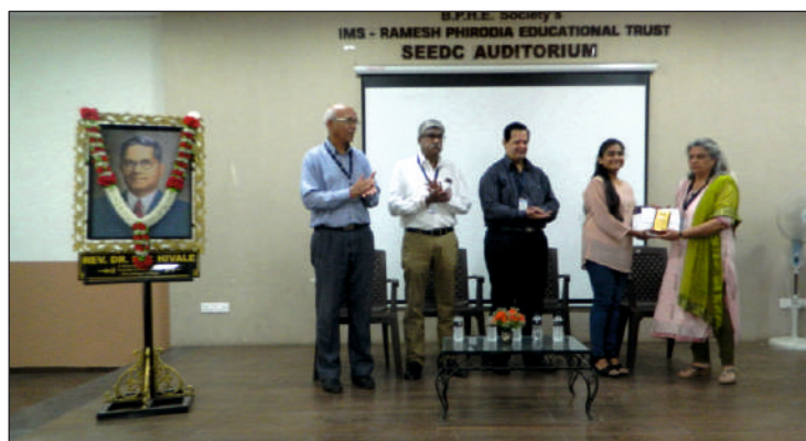
Essay Competition Winner Felicitation