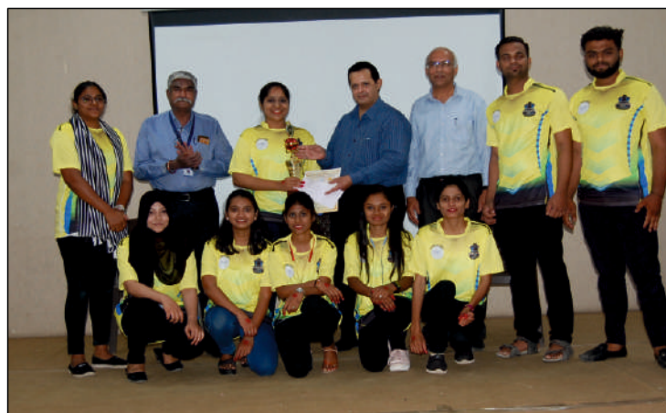
Winners of IT Waves-2022