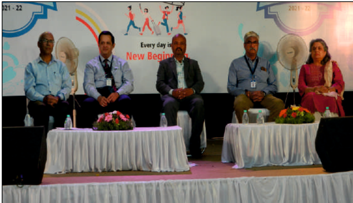
Management Day Inauguration