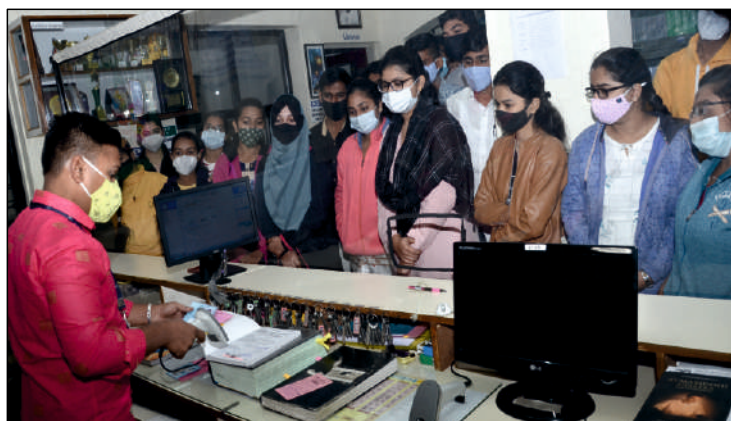
Orientation - MCA Students

As a part of the Information Literacy Programme, the IMS Library hosted a tour and orientation event for freshmen on 5 th , 6 th & 10 th Jan 2022. The goal was to inform newcomers about the library's activities, services, and functions, as well as the rules and regulations, in order to improve library service utilization. The purpose was to introduce the newly enrolled Library user to membership, resources, personnel, facilities, services, clearance, donations, best practices, and e-resource usage, among other things, through organizations such as NPTEL, NDLI, DELNET, and N-List Consortia. Students were urged to take advantage of the Library's specific study materials and book bank sets, as well as join the Telegram Group to take advantage of the Library's online services. Students' admission and exit were coordinated in accordance with COVID-19 SOP rules of face masking and social distancing. Users on the IMS Telegram group were sent a 6.13 minute video clip from the Library. Personal attention, interaction with library staff, and incentive are used to encourage students to use the library, thereby instilling reading habits and self-study.