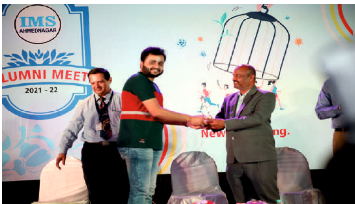
Star Alumni Ward