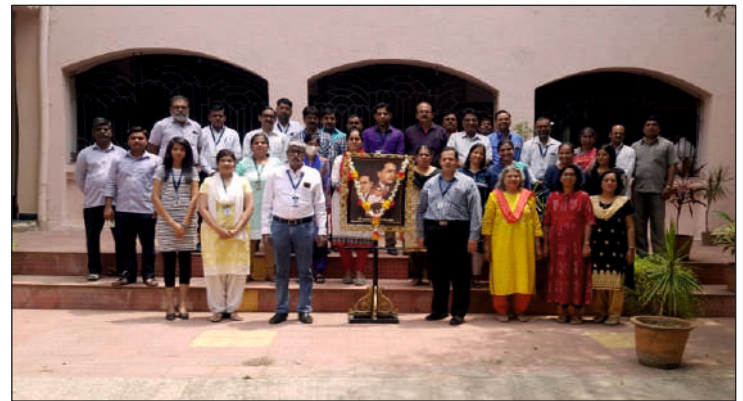
Dr.B.R.Ambedkar-Preamble-13 April 2022-Group Photo