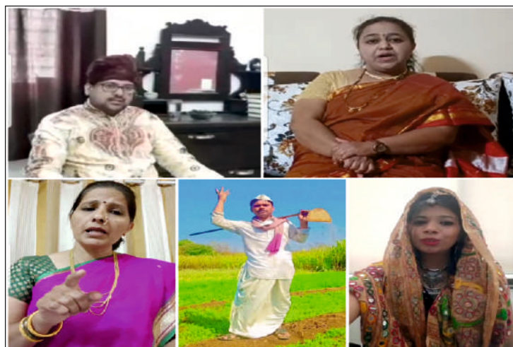
Matrubhasha Diwas-Screen shot-Monologue -Staff participation