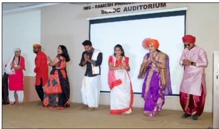
Fashion show- IT Waves 2022