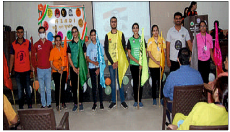
Winners of Management Games-2022