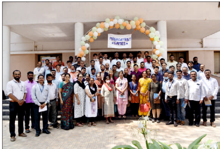
NSS - ETI Batch- Group Photo

which makes this activity unique. The approach promotes the use of digital resources and the importance of libraries as knowledge centres. It inspired officers and educators to promote reading habits, support informal education, boost self-esteem, establish gender equitable attitudes in students, and encourage self-help. Because the workshop is instructive and demonstrative, the volunteers who are pursuing research are well-versed in ICT tools and usage.