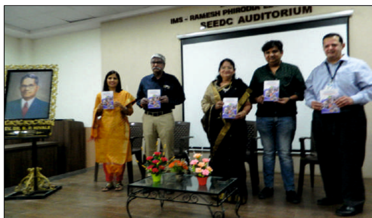
Release of Atmanirbhar Booklet