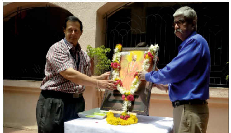
Garlanding the photograph of Chatrapati Shivaji Maharaj

Institute of Management Studies, Ahmednagar celebrated Chatrapati Shivaji Maharaj's coronation day 'SHIV SWARAJYA DIN' on 6 th June 2022. This important day is observed to commemorate the great Maratha King – Chatrapati Shivaji Maharaj.